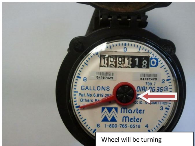
Wheel will be turning

Unlike the meters above the reading for our master meters as seen below would be 5911.